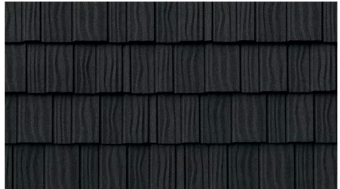
DECRA SHAKE XD Midnight Eclipse