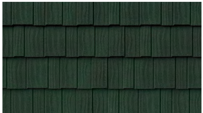
DECRA SHAKE XD Woodland Green