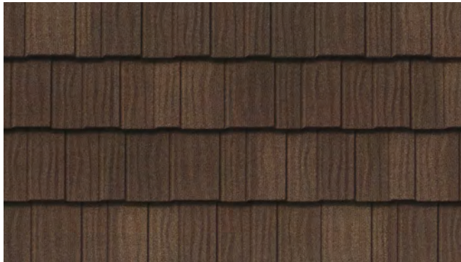
DECRA SHAKE XD Antique Chestnut